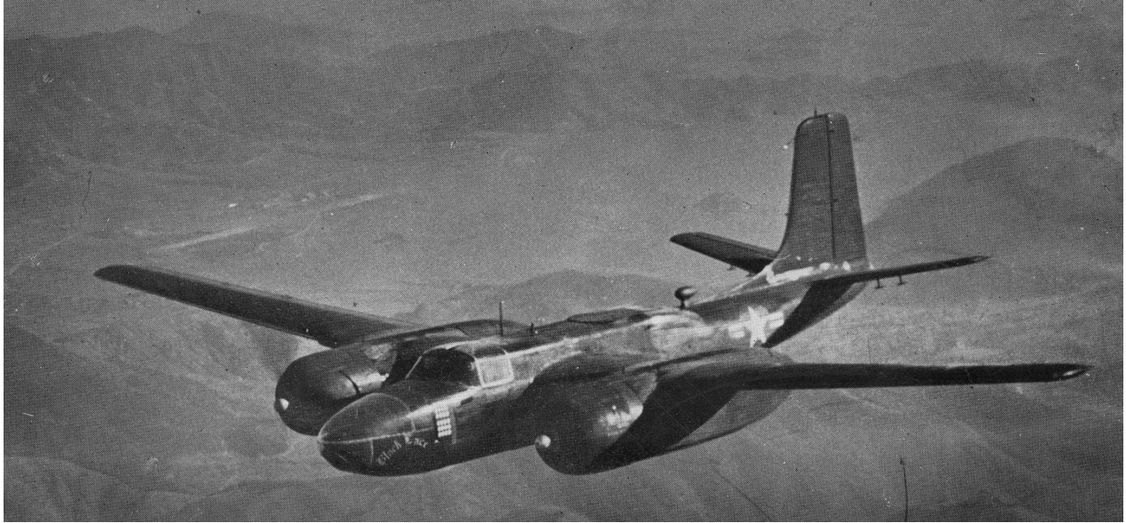
162 TRS RB-26C

As the new year began, combat crew members passed the fifty mission mark and looked forward hopefully to replacement and return to the United States. During the last week Of December, twenty five new officers joined the squadron, assuring that the squadron's mission would be accomplished even though the personnel might change.